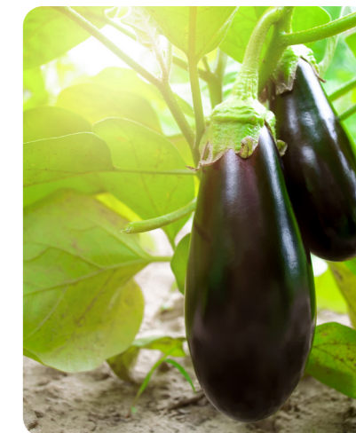
healthy aubergine plant