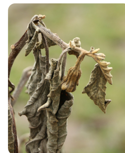
unhealthy aubergine plant