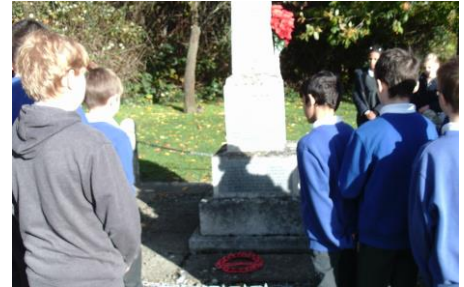
KS2 Local visit for Remembrance Day

Owl Class read the poem In Flanders Field and used this to develop their own poetry about the war. These are two examples of poems from Year 6 pupils.